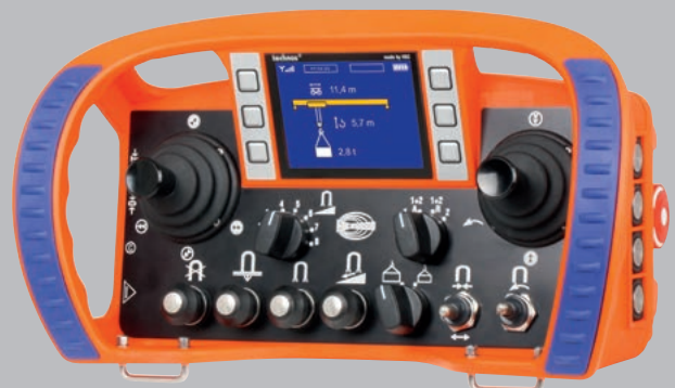
Version for industrial cranes.