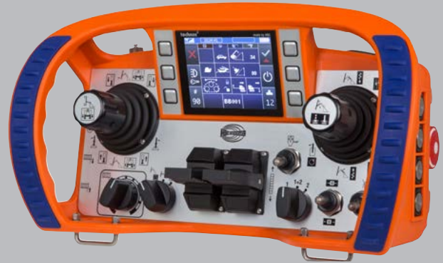
Version with linear levers for mobile hydraulic applications.

Diverse cranes, lift equipment, machinery and many more.