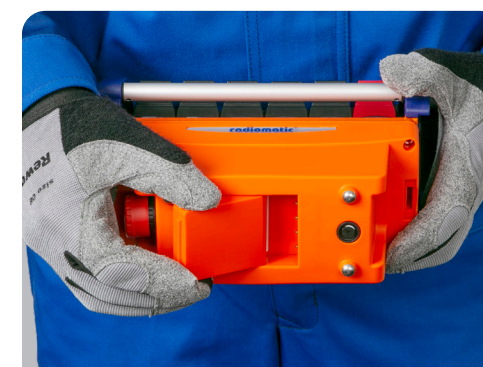
High-performing rechargeable NiMH battery.