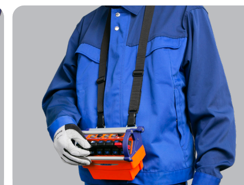
Comfortable carrying by shoulder / neck strap.