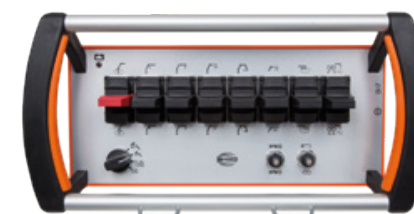
Version with linear levers.